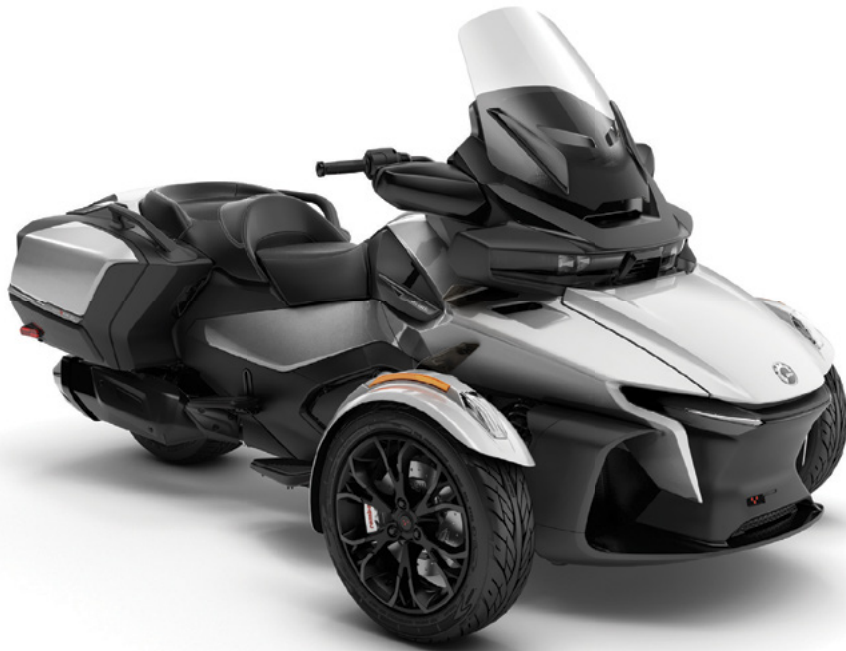
■ HYPER SILVER